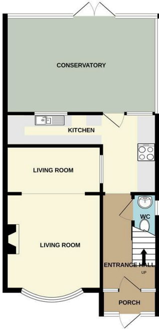
GROUND FLOOR 590 sq.ft. (54.8 sq.m.) approx.